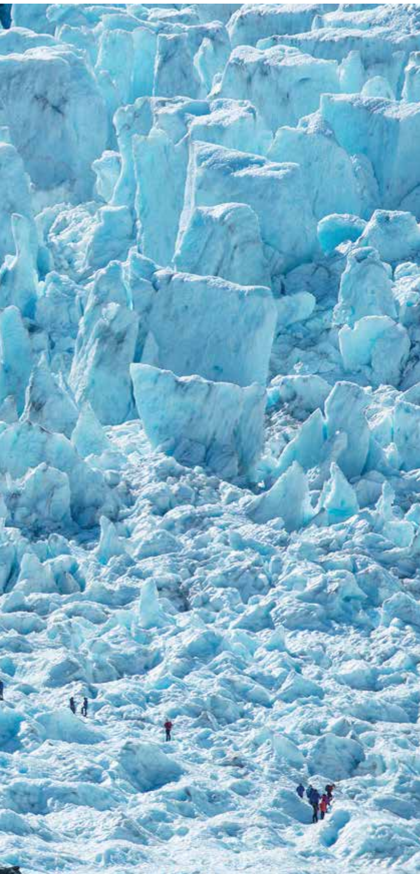
nata o Hine Hukatere . . .