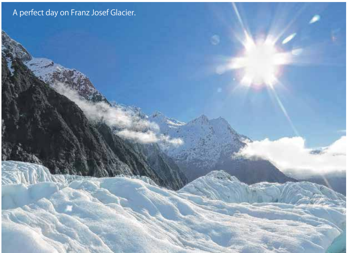
A perfect day on Franz Josef Glacier.