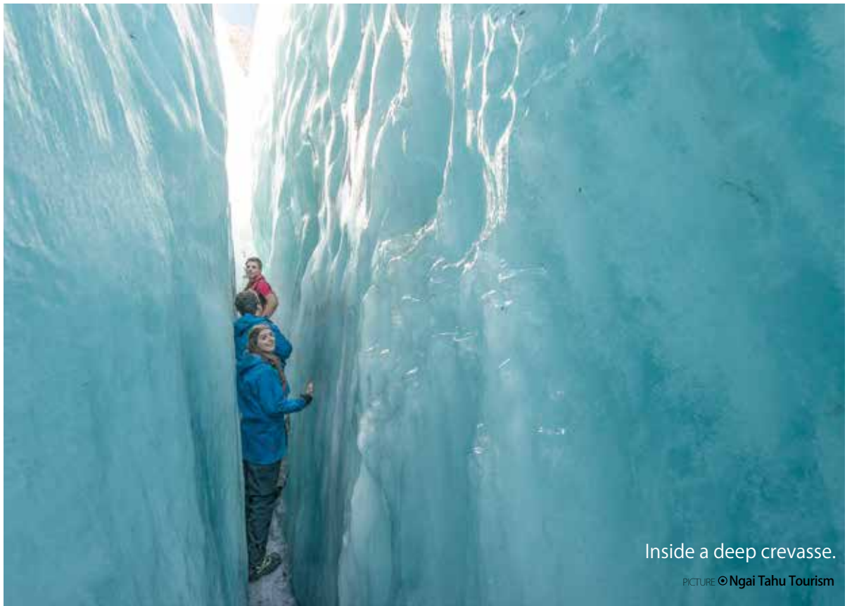
Inside a deep crevasse.